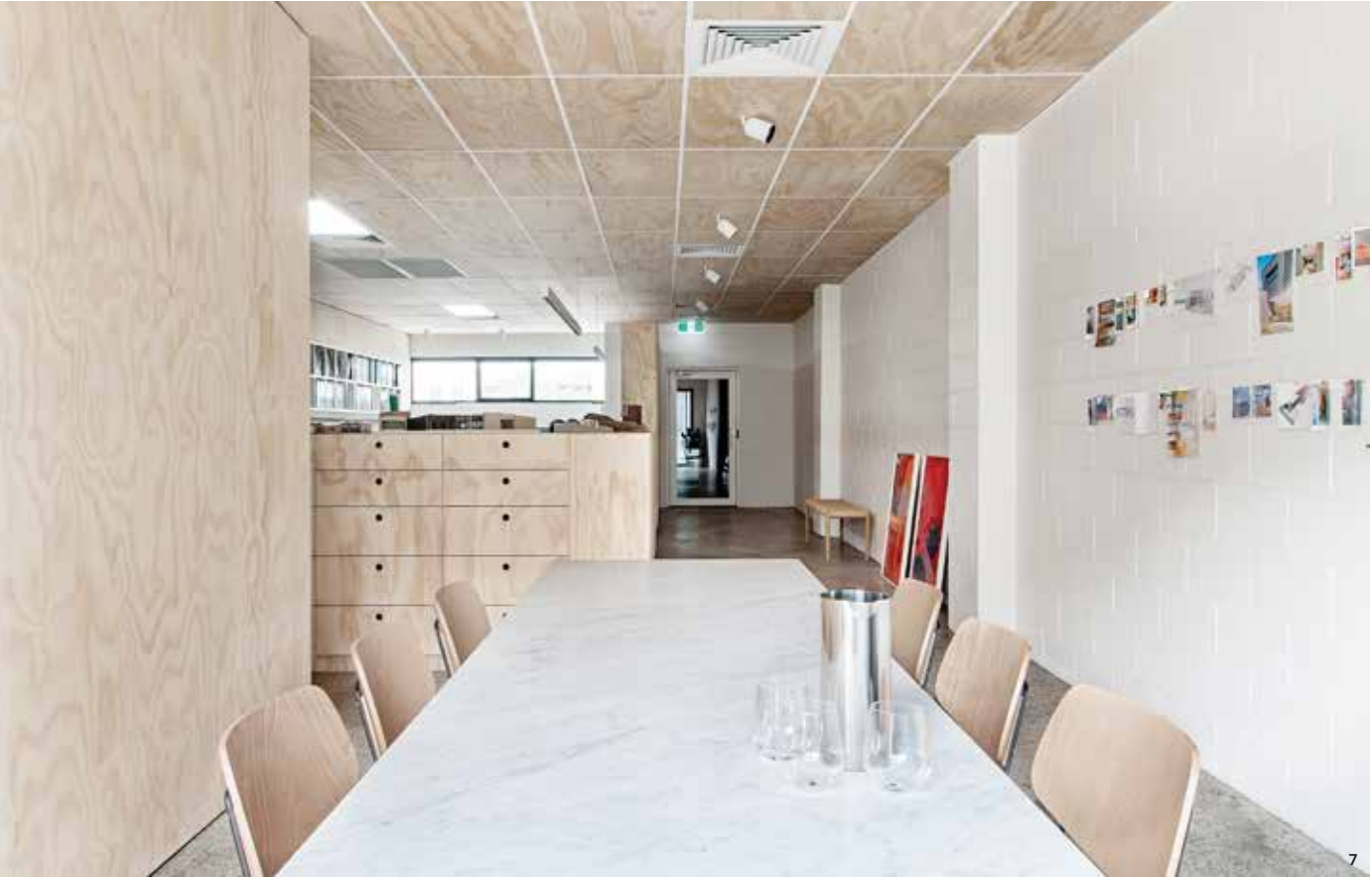
7. PLYWOOD WALLS, CEILING AND JOINERY SURROUND THE ARCHITECTURE STUDIO'S MEETING SPACE. 8. THE ARCHITECTURE STUDIO IS A SPACE JUST THE RIGHT SIZE FOR THE TEAM OF EIGHT WHO WORK TOGETHER CLOSELY.