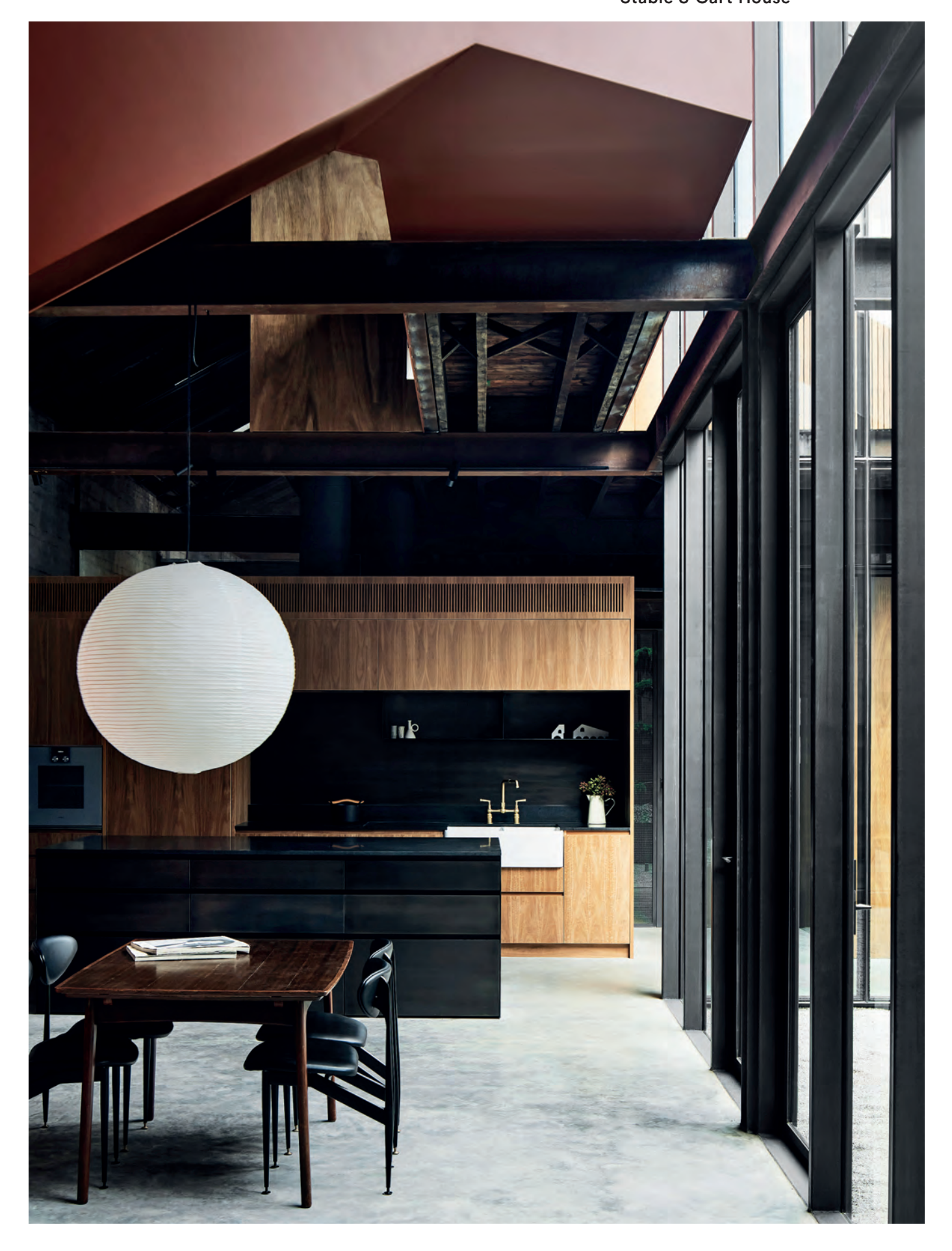
Stable & Cart House