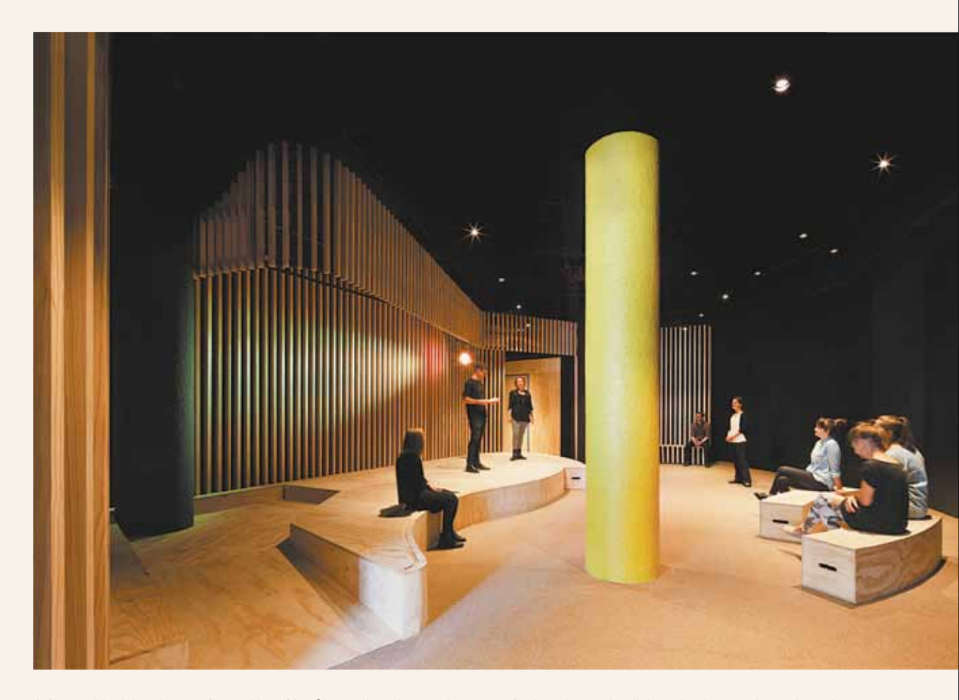
A former black box is transformed into 'the Channel', an immersive space for learning and collaboration in sound, music and technology.

capital, The Nightingale asked likeminded architects to invest in the model. Twenty-seven shares were issued and Clare Cousins Architects bought one, along with other firms such as Six Degrees, Wolveridge and Andrew Maynard Architects. The idea? By knocking off superfluous items, such as car parks, agent fees and display suites, time and money are allocated to conscious and long-lasting design. The Commons – a much awarded pilot building using a similar model - is already up and running, but The Nightingale takes things further with an eight-star energy rating. "The idea is that this model can be replicated over numerous sites; each designed completely differently," Clare explains. "Six Degrees are already working on the next one, Andrew Maynard is looking to do one and so are we... Working together only strengthens it. The point is to create great spaces. Not just to hit a bottom line. That's the spirit we want to foster."