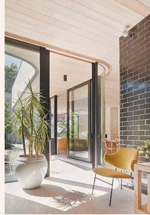
Above (L-R): light and curved vistas in the Brick House, an addition and renovation to a single fronted Edwardian house in Prahran.