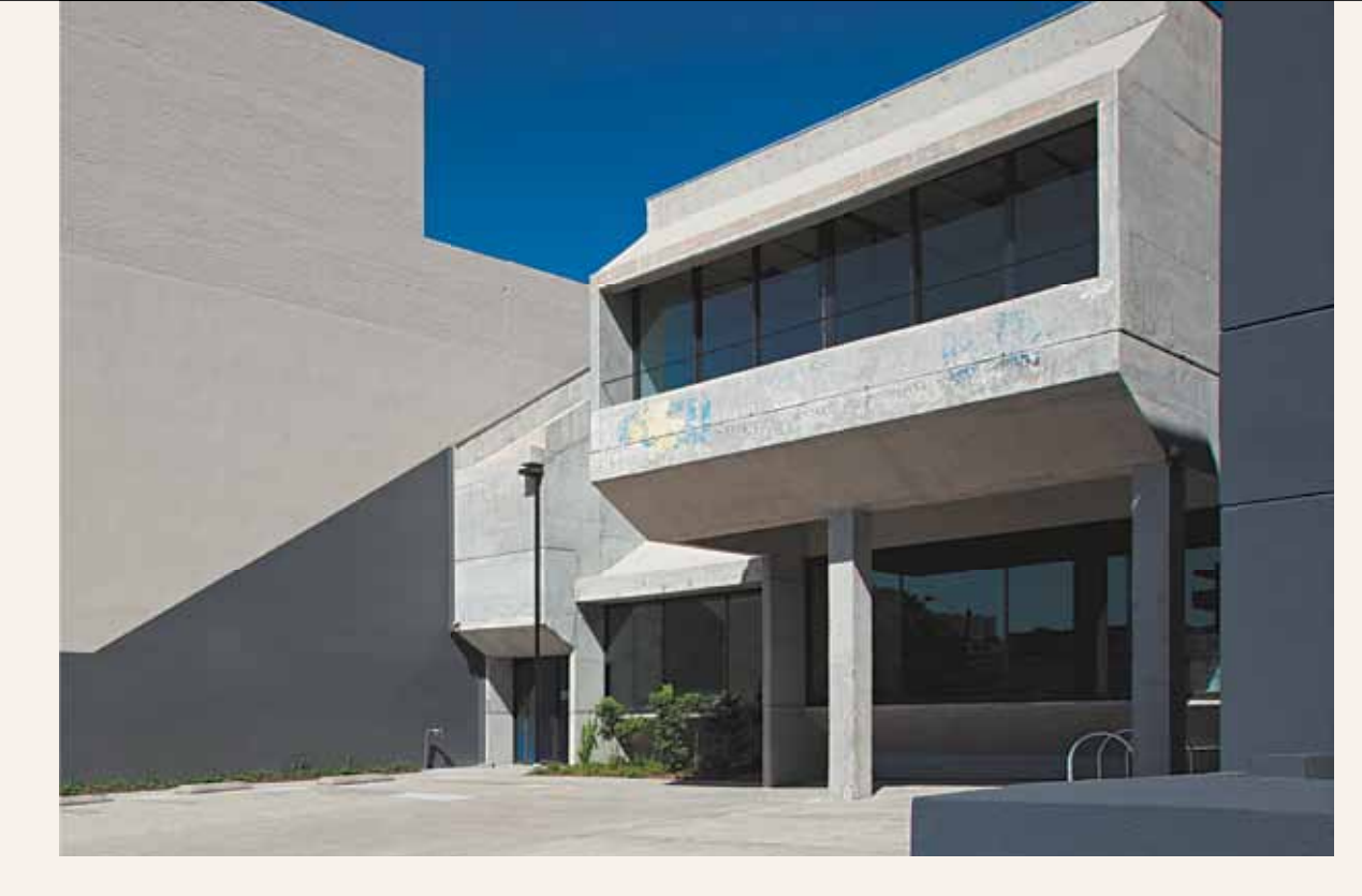
Previous page: Clare Cousins in the meeting room at the Blackwood Street Bunker. Photograph by Daniel Aulsebrook. Above: raw beauty of The Blackwood Street Bunker. Photograph by Lisbeth Grosmann. Opposite: breeze blocks and framed views in 'the Bunker'. Photograph by Lisbeth Grosmann.

Clare Cousins Architects is a diverse studio. Based in a North Melbourne workspace dubbed 'The Blackwood Street Bunker', a semi-brutalist space that adjoins her husband Ben's building practice, the design pits open-plan desks against glazed office spaces. Raw concrete flooring connects with warm plywood walls; floor-to-ceiling windows reveal a generous deck. What was once a cramped, low-ceiling '70s office block is still a low-ceiling '70s office block, now softened with curved walls, subtle planting and airy communal spaces.