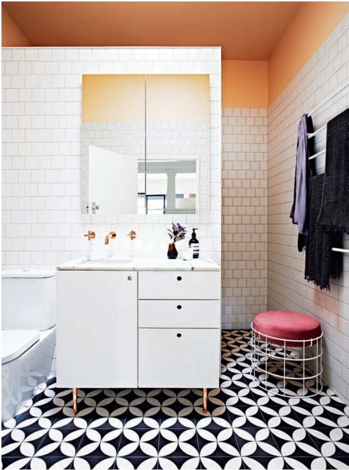
‘5 GREAT FINDS AND ‘ON THE SURFACE’ PRODUCT SOURCING: DANIELLE SELIG. PAINT COLOUR MAY VARY ON APPLICATION